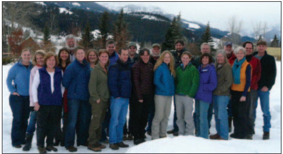
Greater Yellowstone Coalition Staff, February 2010

Photo Credits — Cover: grizzly bear and cubs (Cindy Goeddel); Page 2: bison and calf (Tom Murphy); Page 3: Grand Canyon of the Yellowstone (Cindy Goeddel); Page 4: bison in Yellowstone National Park (Cindy Goeddel); Page 5: GYC members at Inspiration Point, Grand Teton National Park (GYC Archives); Page 8-9: bighorn rams near Yellowstone National Park's north entrance (Chris K. Grinnell); Page 10: wolf in Yellowstone's Hayden Valley (Tom Murphy); Page 11: camp at Baptiste Lake in the Wind River Range (George Wuerthner); Page 12: red fox hunting (Linda Kelly); Page 13: lupine on Bozeman Pass (Linda Kelly); Page 14: bull bison (Diane Hargreaves); Page 15: GYC Staff at B Bar Ranch (GYC Archives); Back Cover: bison by Soda Butte Creek (Cindy Goeddel).